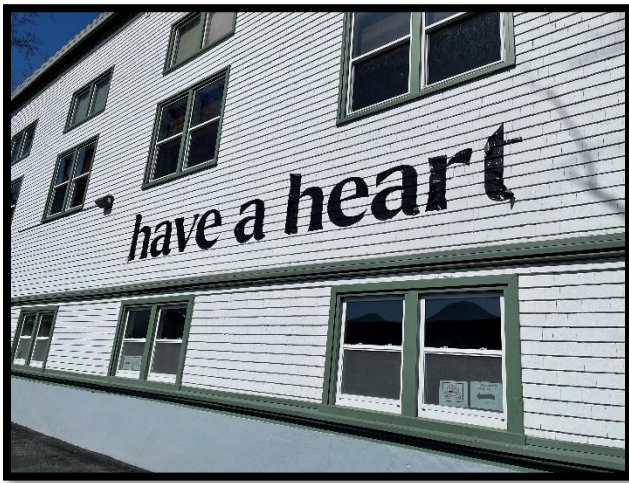
Above: Our parish hall where we currently house up to 20 men during the cold winter months.

Mary and Joseph had a difficult journey. From Mary believing the call of Gabriel to Joseph taking criticism from his community for supporting Mary, living out the Good News of Jesus is not easy, and it is hard work. In the last few years, we have embarked upon this significant ministry. In 2022 we have supported many people. We feed over 200 people weekly through our Food Bank, and our property has provided space for the Dartmouth Community Fridge Project. This past week we concluded our annual Christmas Hamper drive. When war broke out in Ukraine, Christ Church sponsored two Ukrainian families to come to Canada. And this past month, Christ Church opened its doors to the homeless—people needing a place to rest on a cold winter’s night. All of this we have done journeying together. I could not be prouder to be a part of a community that wildly embraces the Gospel of Jesus